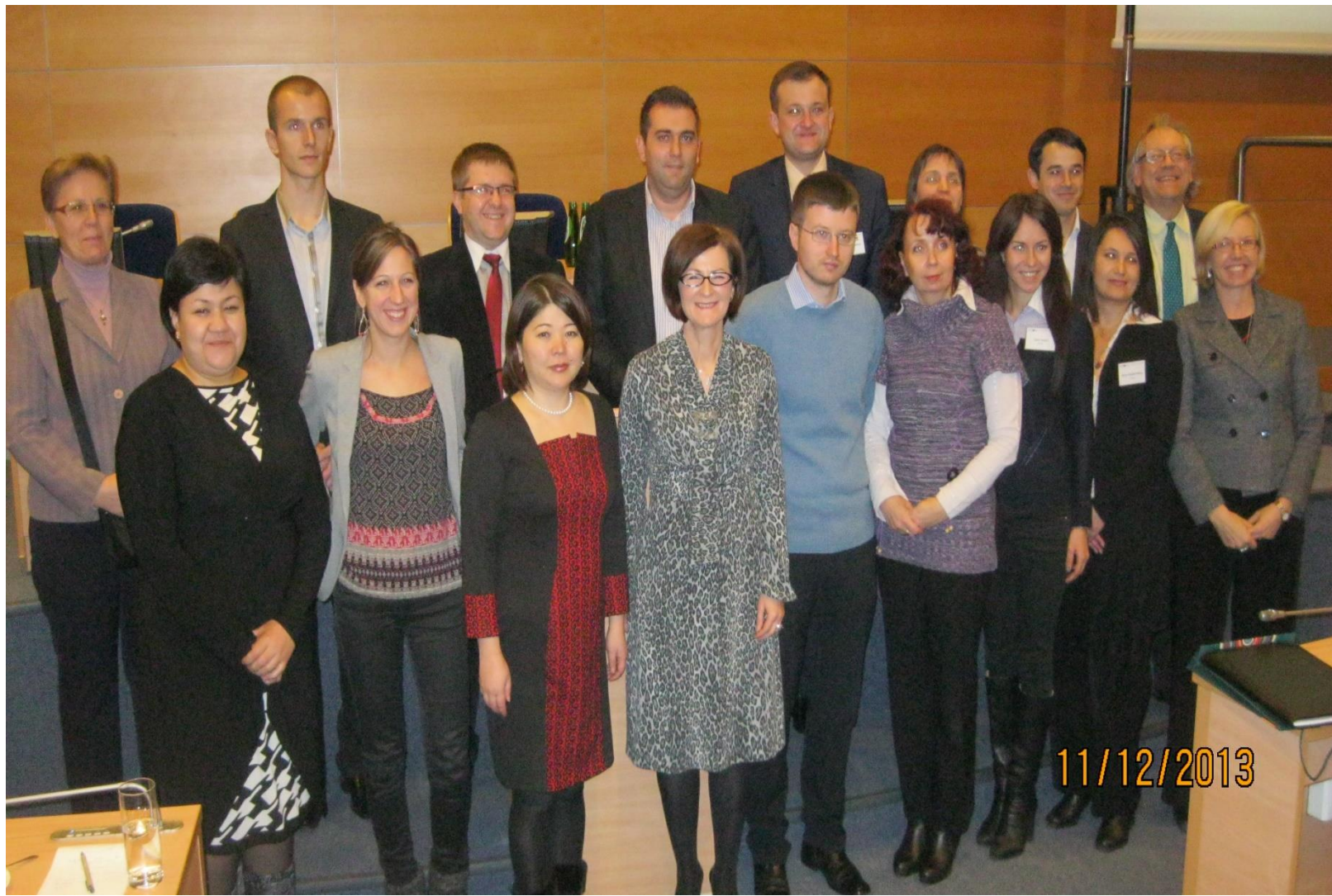
Cracow, Poland – December 2013