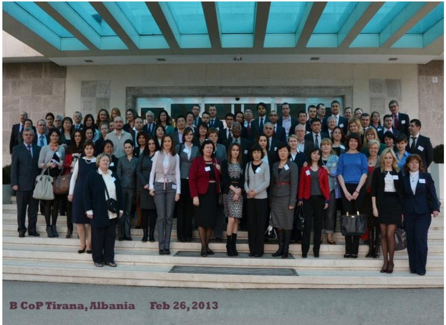
B CoP Tirana, Albania Feb 26, 2013