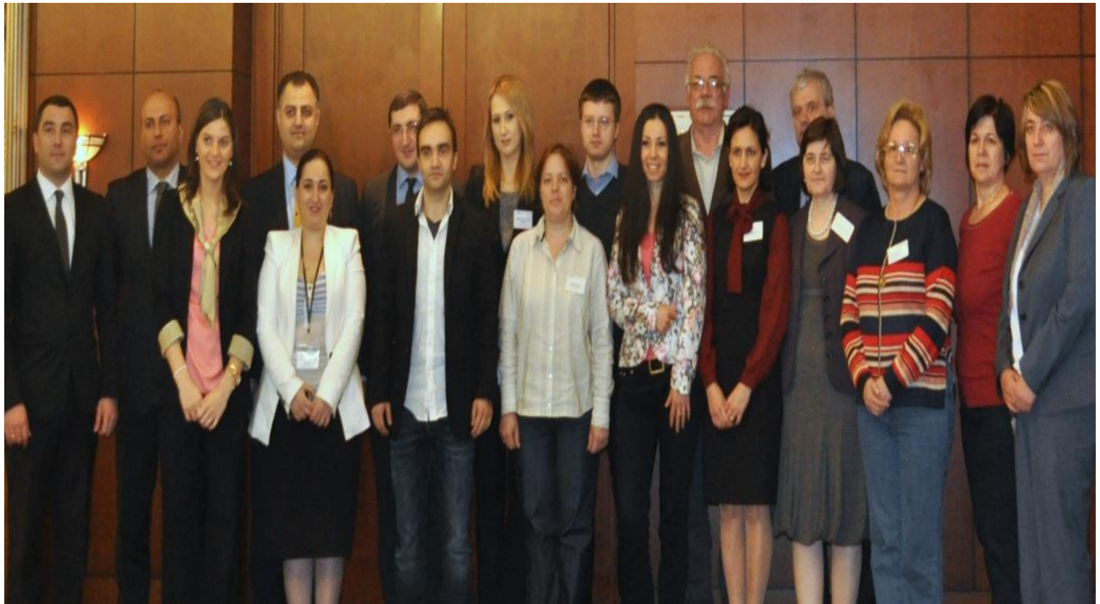
Study visit to Georgian MoF, April 2013