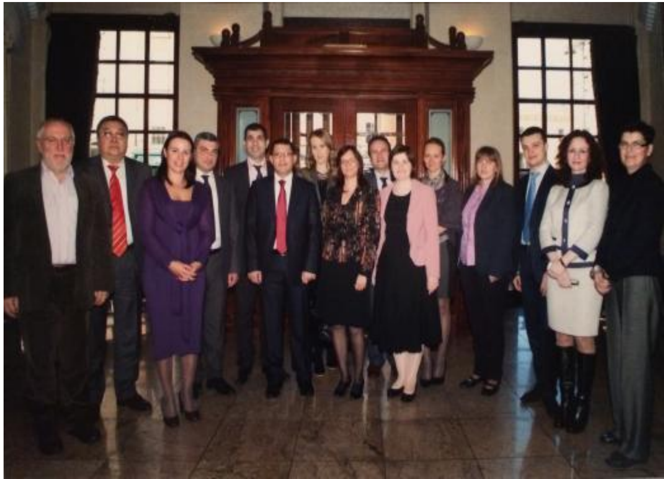
Dublin, Ireland – November 2013