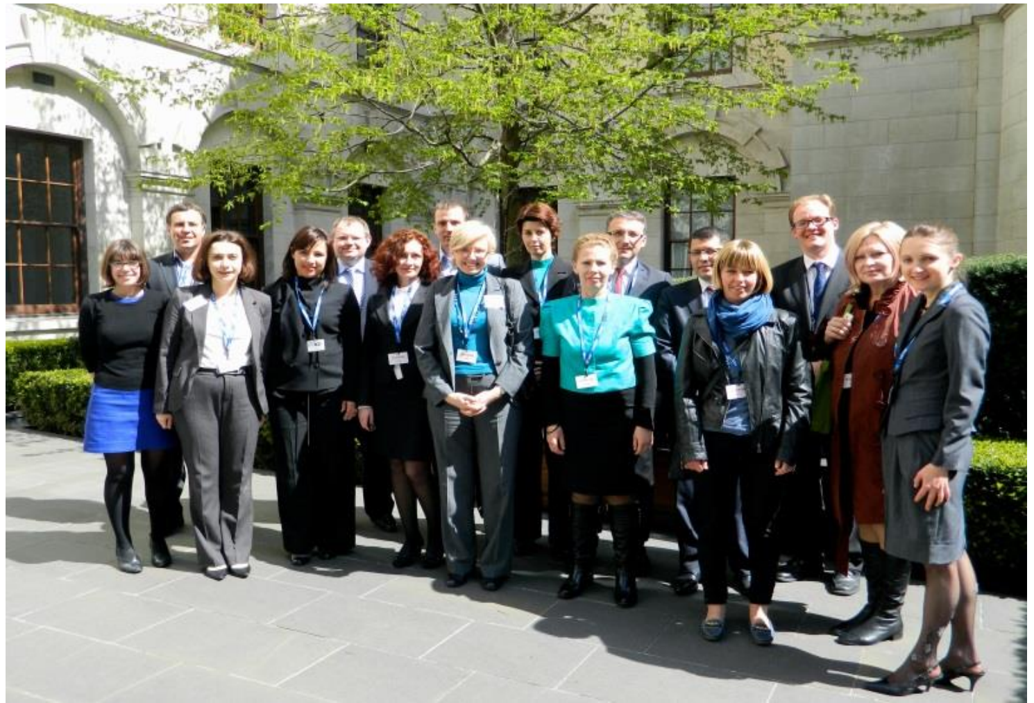
At UK HM Treasury – April 2013