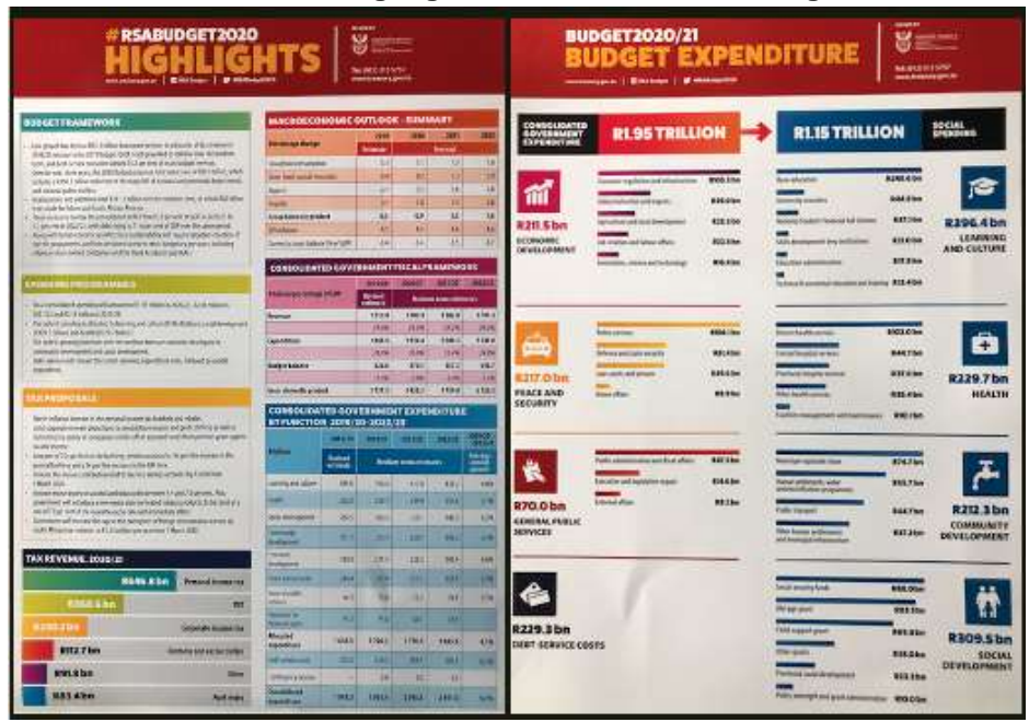
Exhibit 5: Highlights from South Africa Budget

An extensive discussion was held after the presentation. Topics that were discussed further included the presentation of program and performance information in South African budget<sup>1</sup>; responsibilities within the National Treasury for analytical writing; the dissemination of budget documentation via printed copies and electronically; citizens' budget (4 pages of high-level information and data circulated within newspapers and online); and ways to incentivize the media to get engaged and report on the budget.