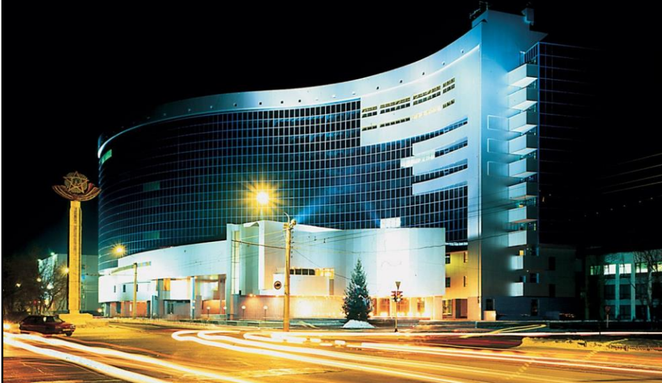
Treasury Committee, Ministry of Finance, Republic of Kazakhstan Astana, Pobedy Bld, 11