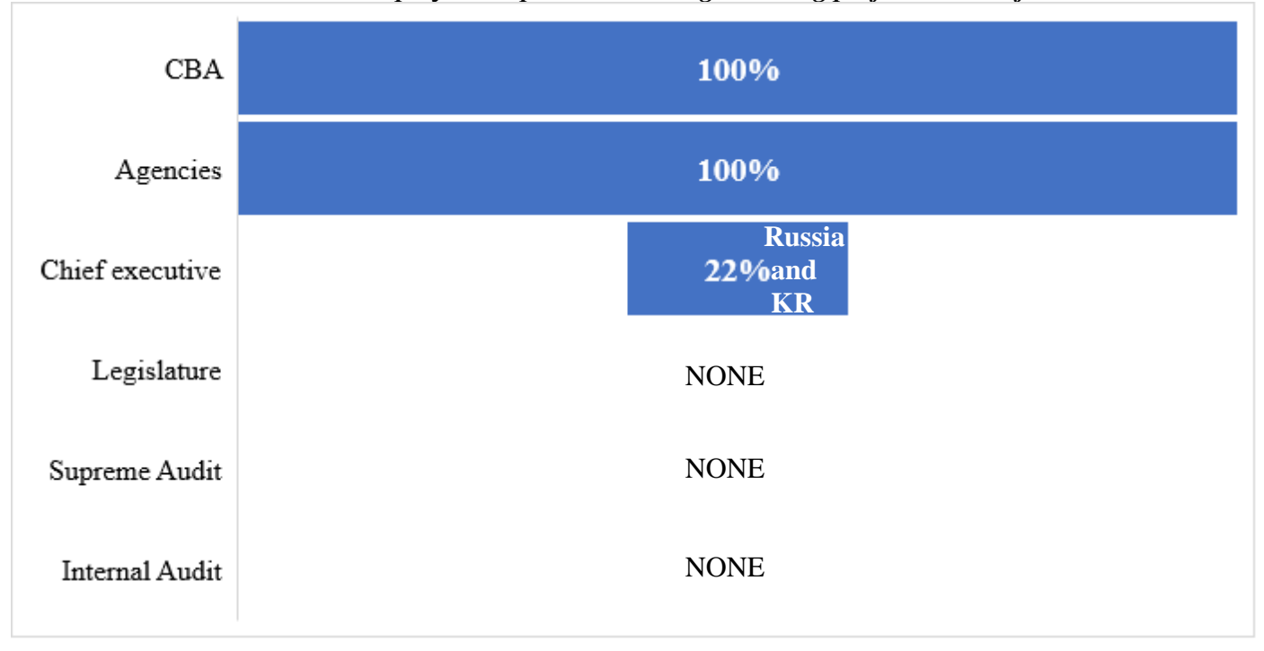
Criterion 4: What are performance budgeting challenges identified as high or medium high among options within the 2016 OECD Performance Budgeting Survey?