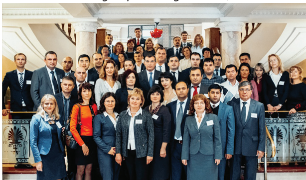
Thematic group meeting in Minsk, 2014