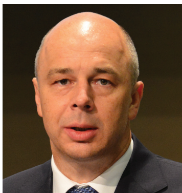
Anton Siluanov Minister of Finance of the Russian Federation

relationships with peers and practitioners from across the region to provide a pool of experts from whom to seek advice and support in its reform program. It also leads several working groups, and regularly shares its approaches and expertise with PEMPAL, and has also hosted several meetings including a major meeting of the whole network on fiscal transparency and accountability held in 2014 in Moscow.